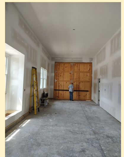
And to Painting! In just one month!