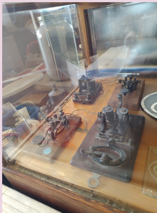
These keys were actual used at our station.