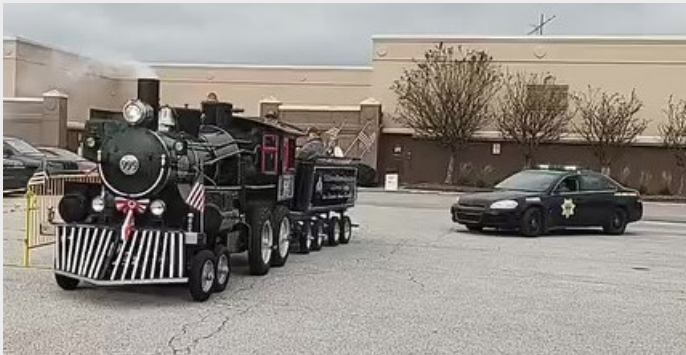
Home Town Heroes Great Lakes Mall

The Collinwood 999 engine was asked to be at two events this past month. One was for Hometown Heroes at Great Lake Mall and Texas Roadhouse invited us to Touch a Truck.