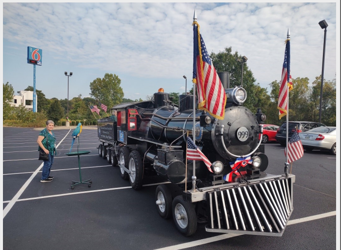
Touch a Truck at Texas Roadhouse.