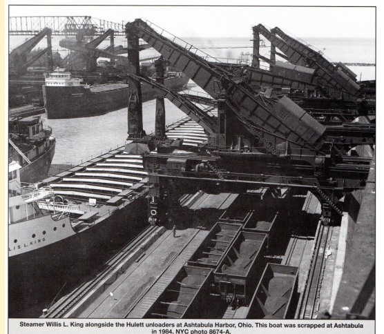
Steamer Willis L. King alongside the Hulett unloaders at Ashtabula Harbor, Ohio. This boat was scrapped at Ashtabula in 1984.

And let's not forget the Railfest Dinner at the Depot on March 16. Again the menu will include Corn Beef and Cabbage. Last year's dinner had 52 guest. So it is without saying, we will need a good cleanup after our winter